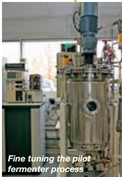
Fine tuning the pilot fermenter process

Supported by teams of technicians and process engineers specialized in bacteria, Lallemand has developed high-performance expertise in the industry. This savoir-faire is enlightened by the scientific knowledge Lallemand has cultivated in the field of winemaking.