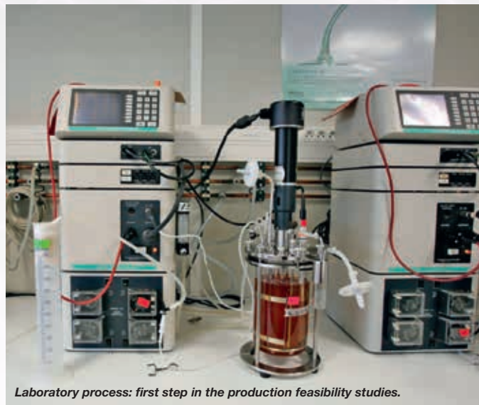
Laboratory process: first step in the production feasibility studies.

Beyond complying with the standards defined by regulations on bacteria populations and microbiological purity, Lallemand has developed their own criteria for quality and malolactic activity based on years of experience. These criteria allow us to guarantee the availability of products with a long, stable shelf life that are robust and vigorous as soon as they are inoculated into musts or wines around the world.