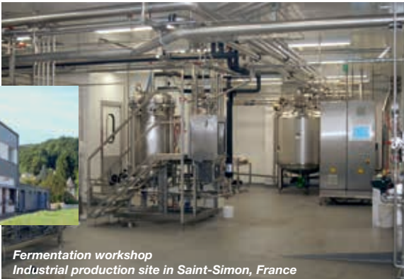
Fermentation workshop Industrial production site in Saint-Simon, France

The plant at Saint-Simon (near Aurillac in south-central France) is at the cutting edge of technology and has earned numerous quality certifications, such as those required for the pharmaceutical industry. The plant is ideal for the production of lyophilized bacteria.