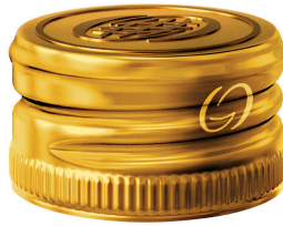
DIVINUM™ classic screwcap