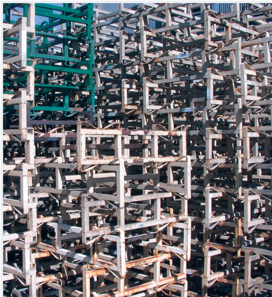
Reusable bone-yard barrel racks rusting in the sun.

While new racks generally cost around $100, to get the equivalent for half is substantial. Even better, to get that rusting boneyard stripped down to bare metal, inspected, repaired and painted in your choice of color, might be something all wineries should consider.