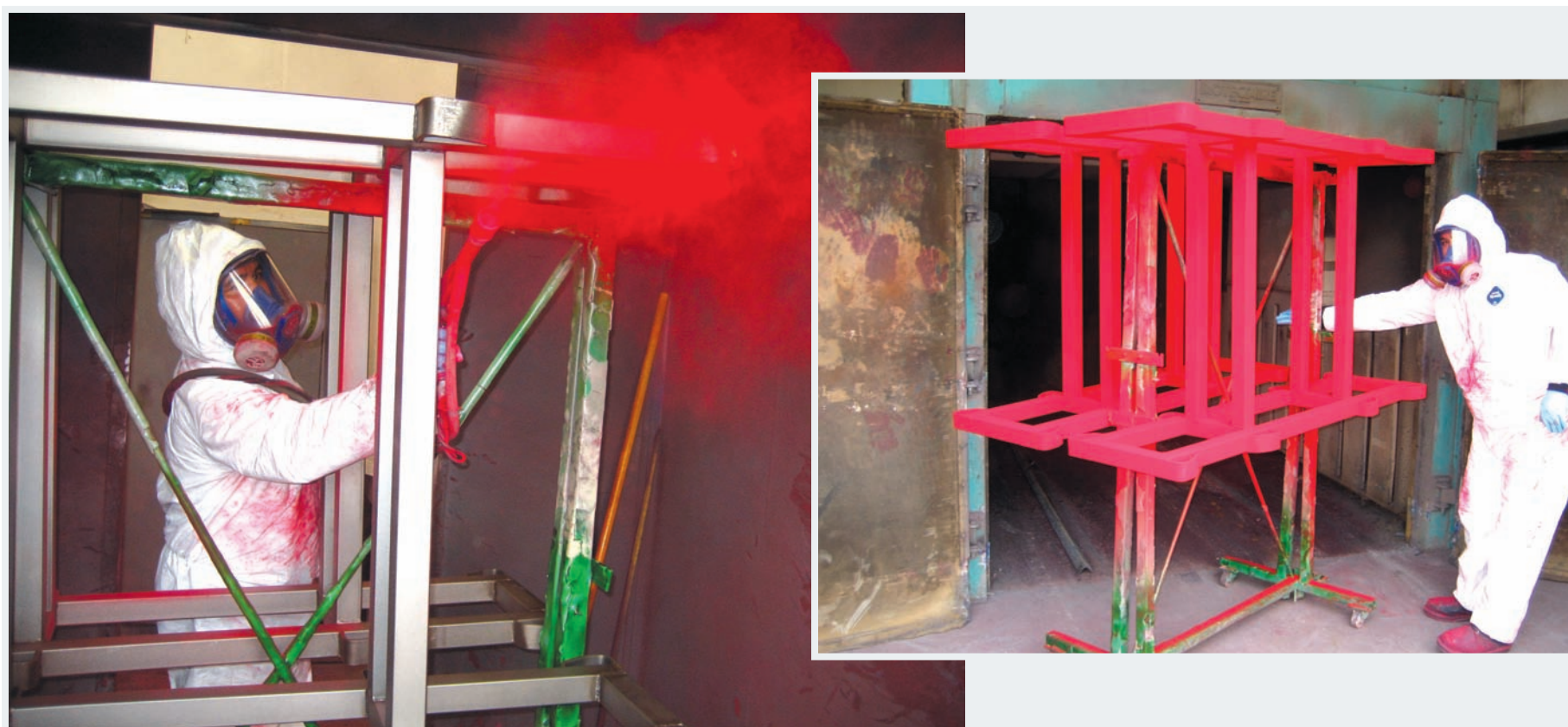
Powder coating the peened metal to a new finish.